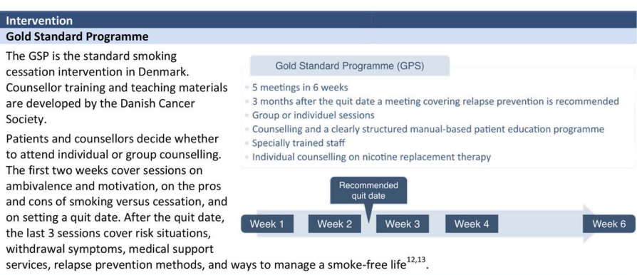
Figure 1 Descriptions of smoking cessation interventions examined in this study. GSP, Gold Standard Programme; SCDB, Smoking Cessation Database.