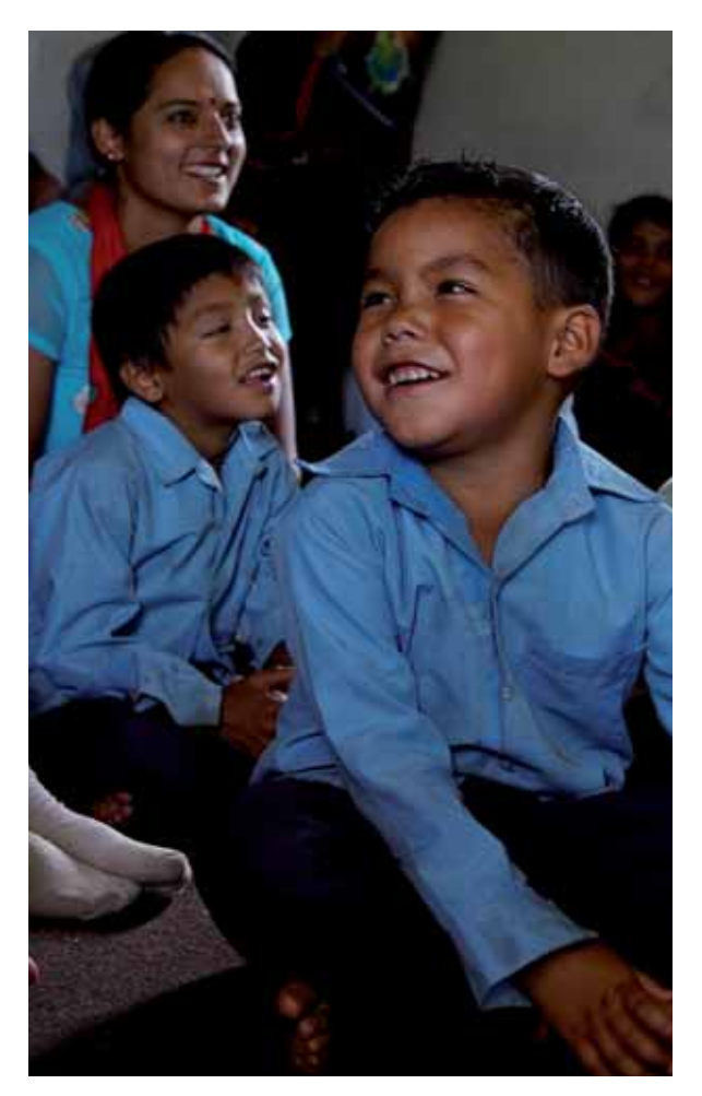
Protection of children and adolescents is one of the primary objectives of a national alcohol policy.

The evidence for such interventions is well summarized in the research monograph, "Alcohol; No Ordinary Commodity" (Babor, T. el al, 2010). That book reviews research findings on 42 commonly used alcohol prevention interventions and rates their effectiveness and efficiency as prevention measures.