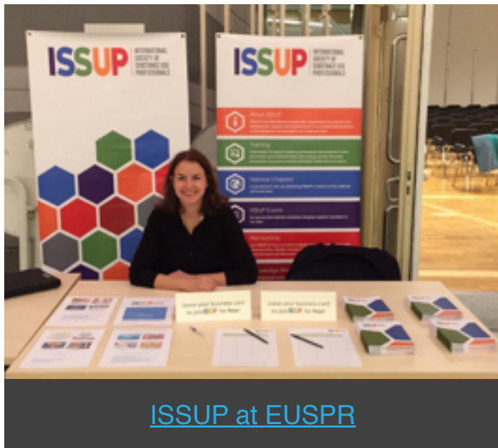
ISSUP at EUSPR