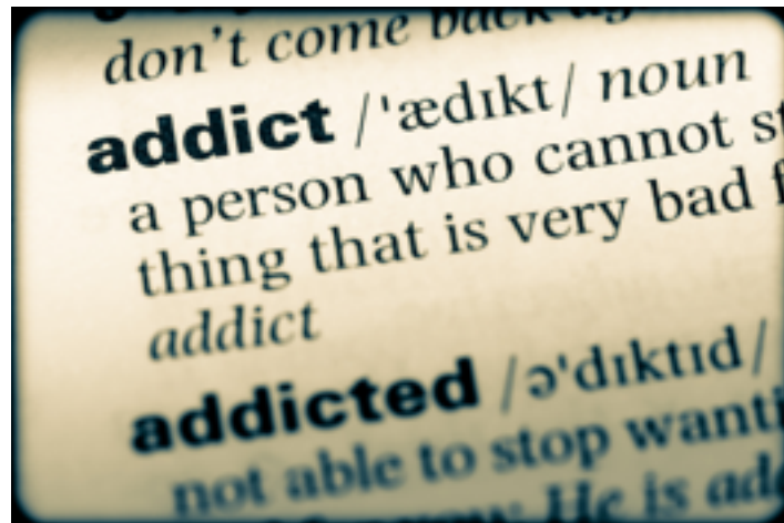
Terminology & Stigma: How Should We Talk about Substance Use?