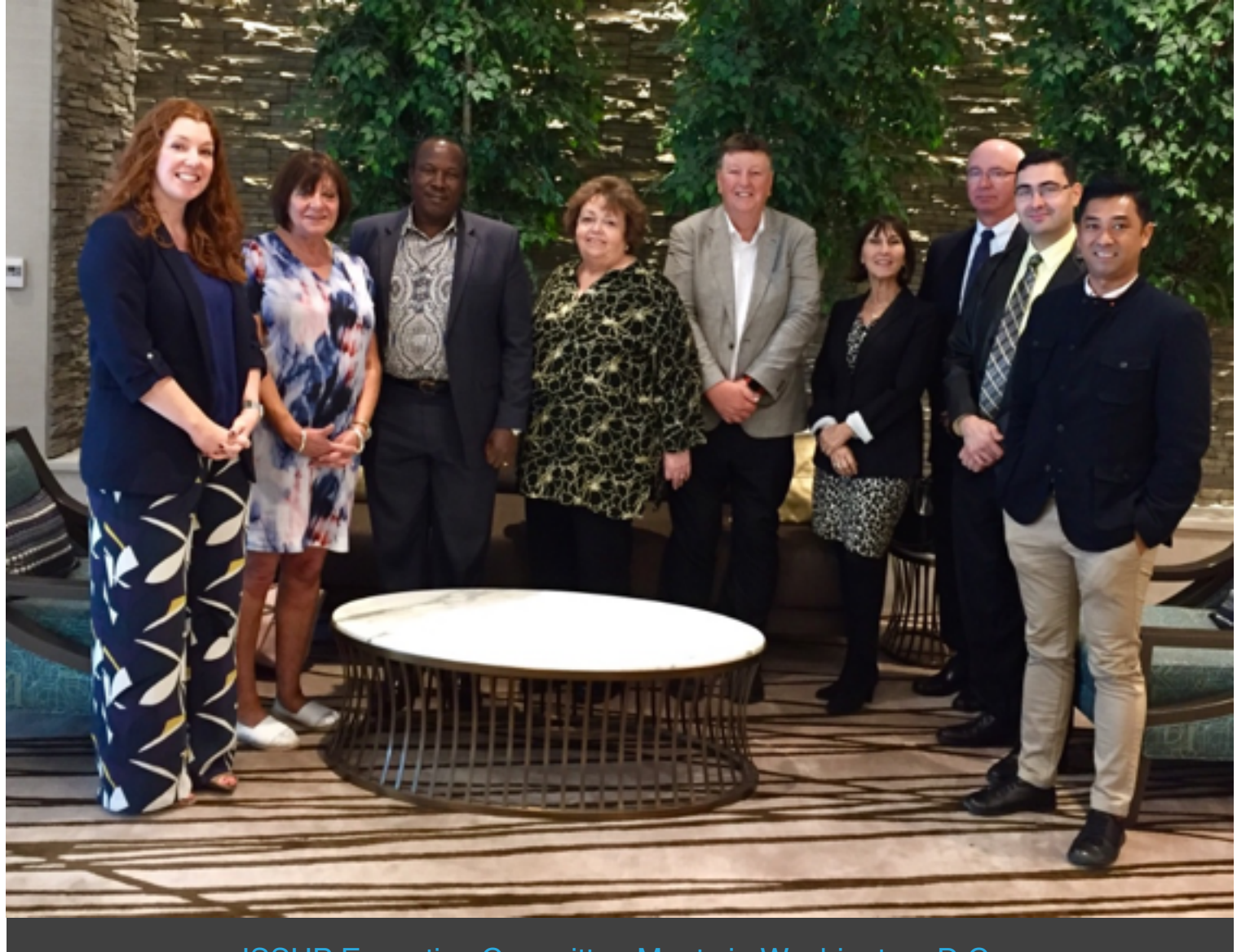
ISSUP Executive Committee Meets in Washington, D.C.