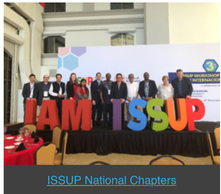
ISSUP National Chapters