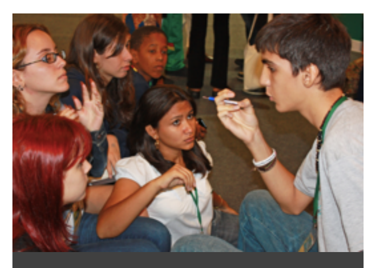
<u>New Resource:</u> Good Policy and Practice in Health <u>Education</u>