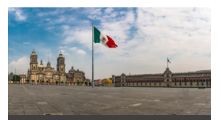
Readiness and Barriers to Adopt Evidence-Based Practices for Substance Abuse Treatment in <u>Mexico</u>