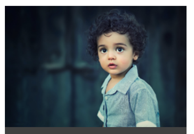
Medications in Drug Treatment: Tackling the Risks to Children