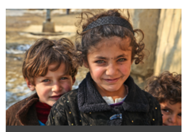
Afghanistan National Drug Survey