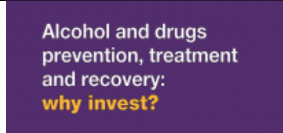
Resource for Healthcare Professionals