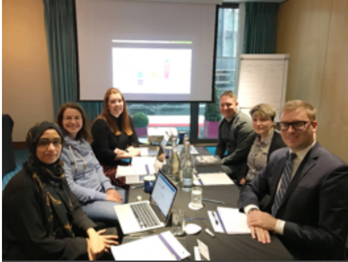
ISSUP Website Developments