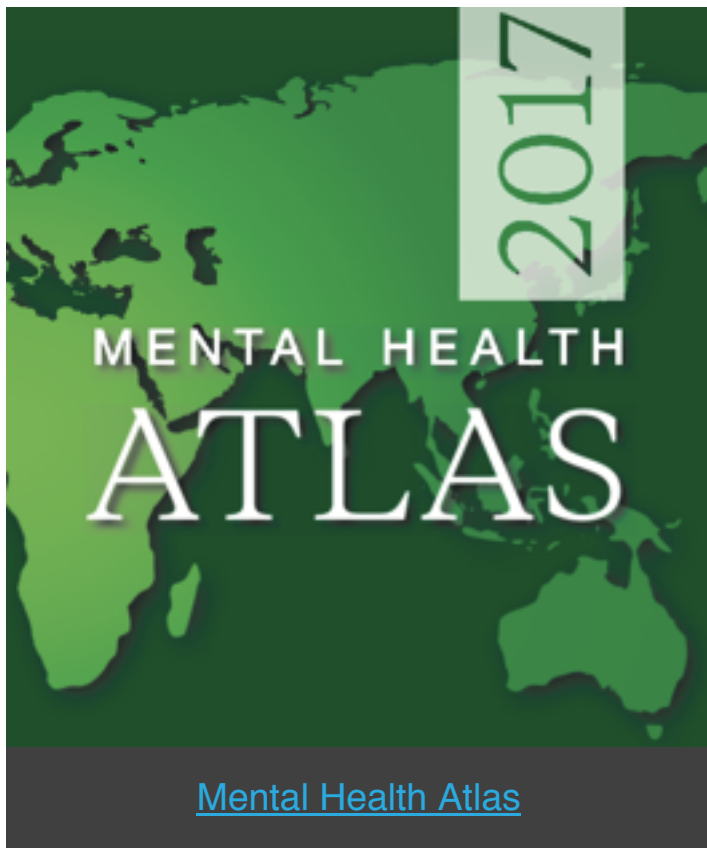
Mental Health Atlas