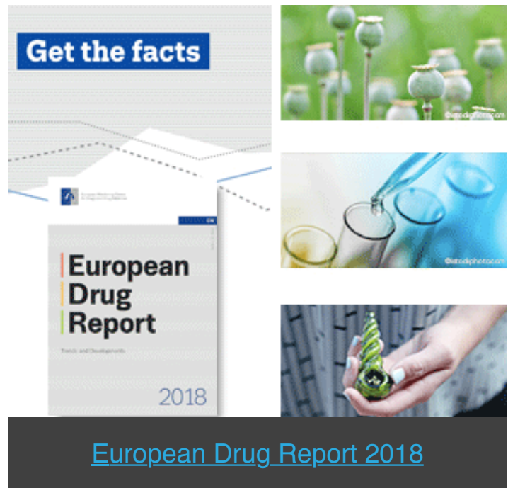
European Drug Report 2018