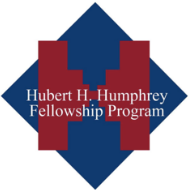
Humphrey Fellowship Program