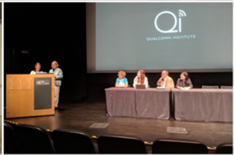
3rd ICUDDR Conference