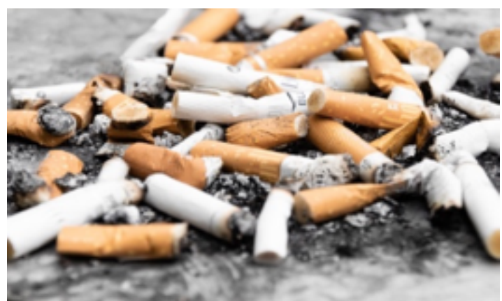
Global Statistics on Alcohol, Tobacco and Illicit Drug Use