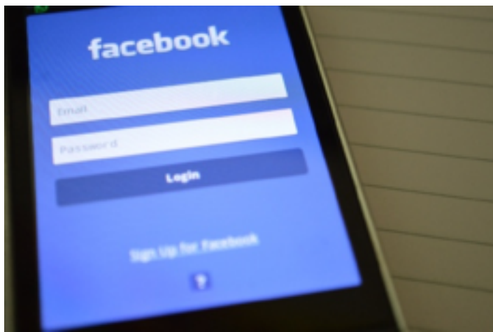
Facebook Feature to Tackle Opiates