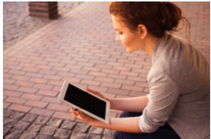
NIDA Easy to Read Drug Facts