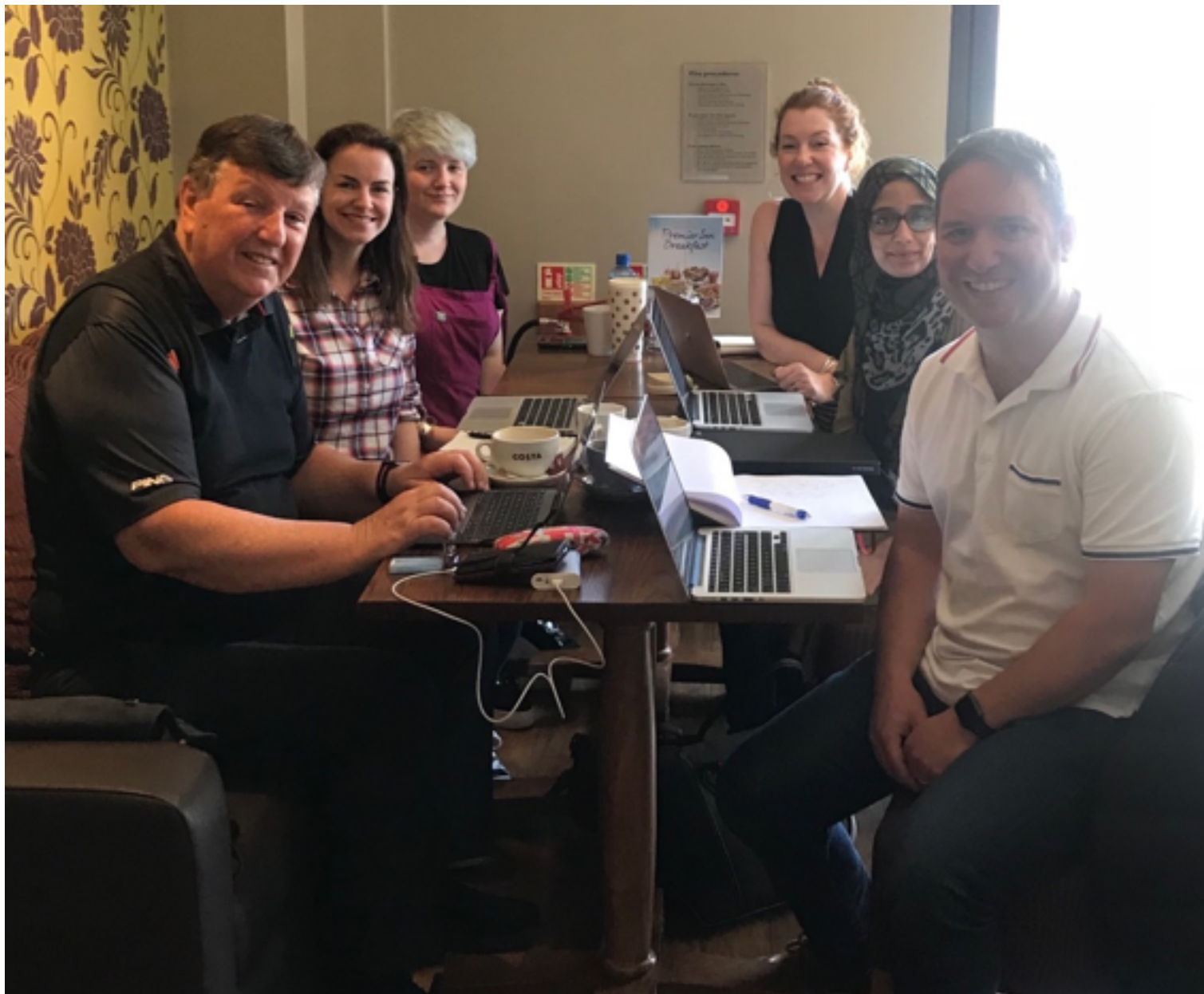
ISSUP Staff Team June Meeting