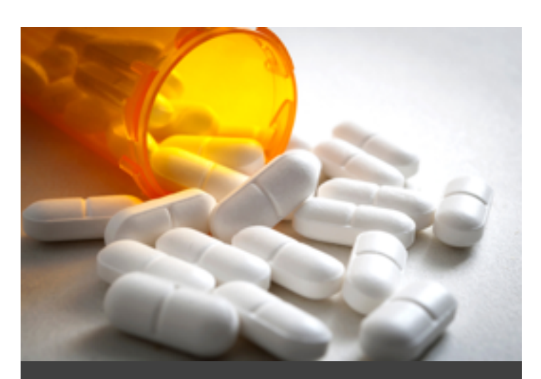
Federal Response to the Opioid Crisis in the US