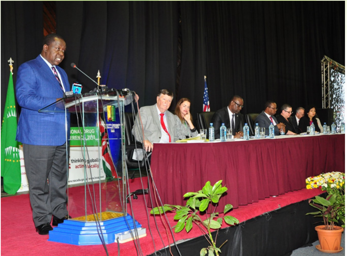
OPENING CEREMONY- Dr. Fred Matiang'i, CS Ministry of Interior & Coordination of National Government - 'Kenya Remains Resolute in fighting drug and substance abuse and its networks. Since the government cannot work in isolation, we will work across all sectors and upholding partnerships and collaborations that we are signatories to.'

In December 10-14, 2018, the Ministry of Interior and Coordination of National Government under the leadership of NACADA partnered with the African Union and International Society of Substance Use Professionals (ISSUP) in undertaking the first ever International Conference on drug demand reduction in Africa. Held at the Kenyatta International Convention Centre, (KICC) the five-day conference brought together partners from over 80 countries worldwide. The conference provided an opportunity for sharing experiences and best practices which can be customized to address local challenges in prevention and advocacy; policy, legal and enforcement; research and training; and treatment and rehabilitation of Substance Use Disorders. engage with leading experts in the diverse field of drugs and substance abuse prevention, treatment and aftercare.