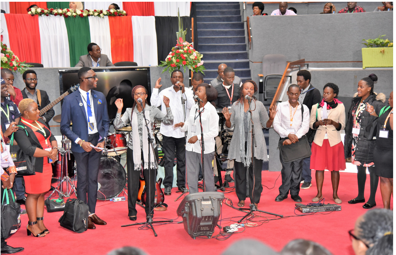
The UNODC Youth Declaration Statement on stepping up action for effective interventions to reduce substance use harm and demand in Africa.