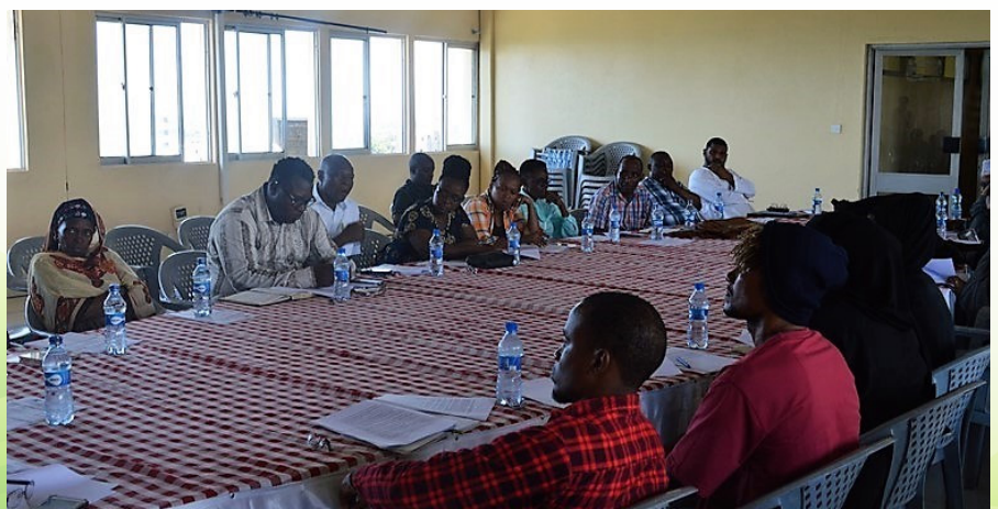
Stakeholders at a townhall meeting in Mombasa during a Community engagement forum

Recommendations made during these forums have since been incorporated into the document.