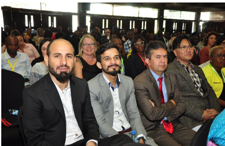
GLOBAL PARTICIPATION - Delegates from over 84 countries attended the first ever ISSUP Drug Demand Conference to be held in Africa and the fourth to be held globally.