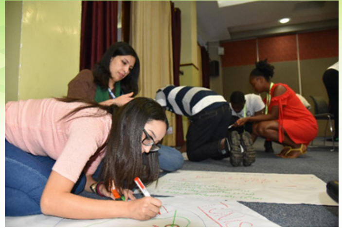
The Youth Forum sampled two projects from a myriad of community-focused projects they worked on with over the last five days of the conference.