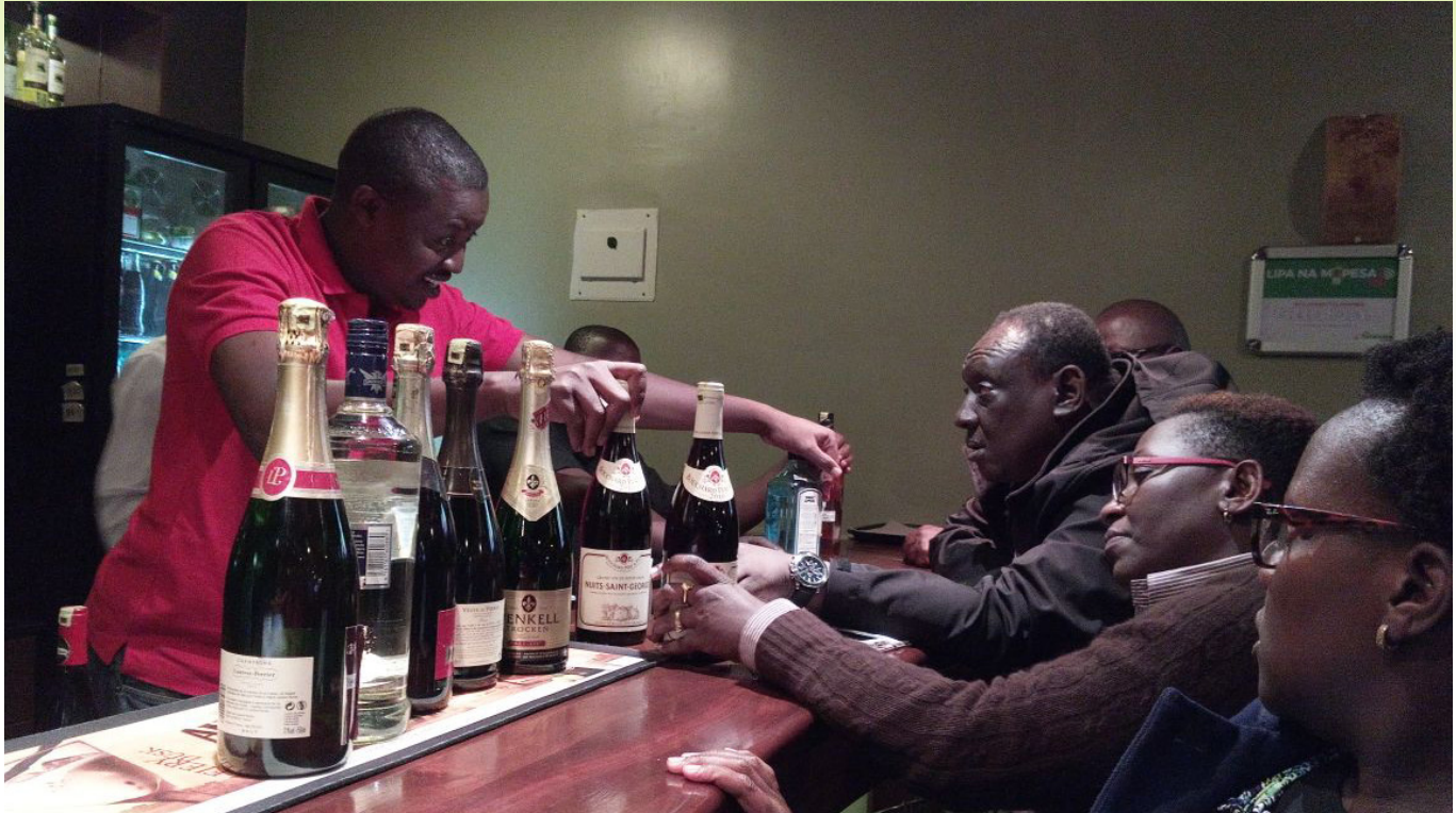
A bar patron being educated by the National Crackdown Multi-Agency team on how to check for compliance to the various laws and regulations governing the liquor business.

A 100-day Rapid Results Initiative (RRI) exercise was launched by the Cabinet Secretary of the Ministry of Interior and Coordination of National Government, Dr. Fred Matiang'i on March 1st, 2018 at Kenya School of Government, Nairobi.