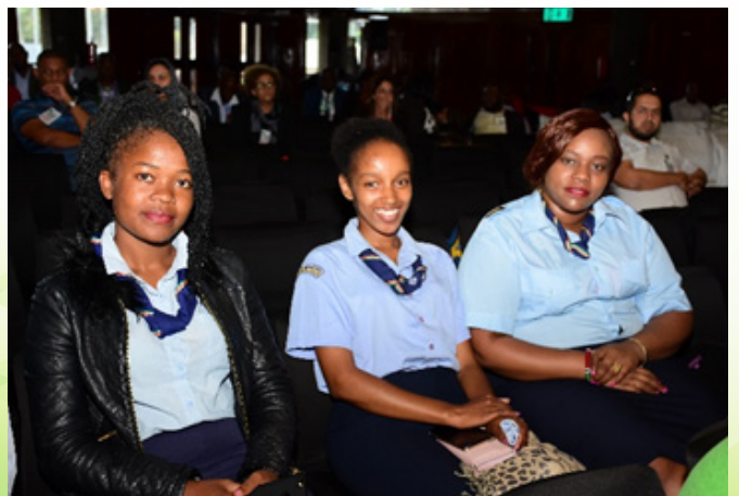
Youth from various organizations listening attentively during a session at the Conference.