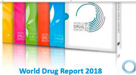
World Drug Report 2018