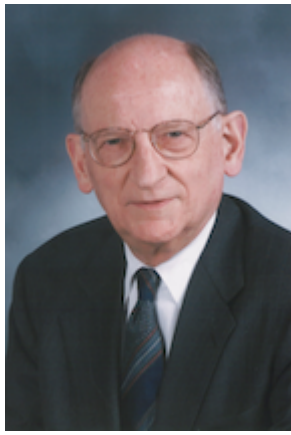
Otto F. Kernberg

Professor of Psychiatry Weill Cornell Medical College