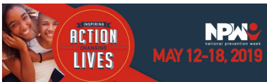
SAMHSA's National Prevention Week, May 12-18