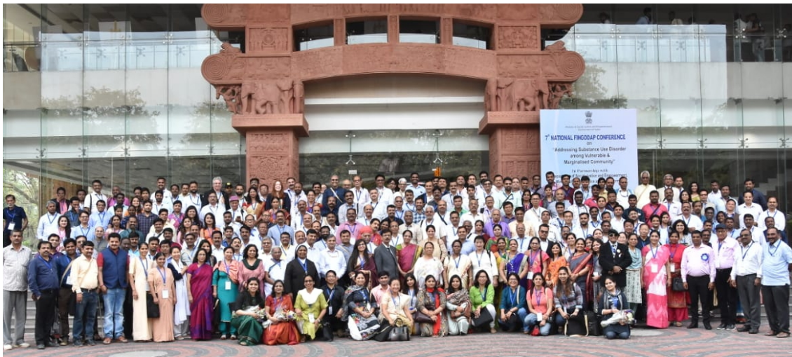
Ceremonial Launch of ISSUP India