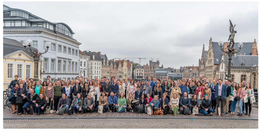
ISSUP at the EUSPR Conference in Ghent

It has been another busy month for ISSUP! All focus has been on prevention as we made our way to Ghent for the European Society for Prevention Research Conference where we shared ISSUP with colleagues in the prevention field.