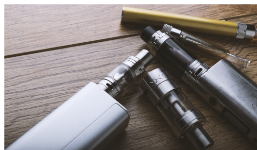
What Are the Respiratory Effects of E-cigarettes?