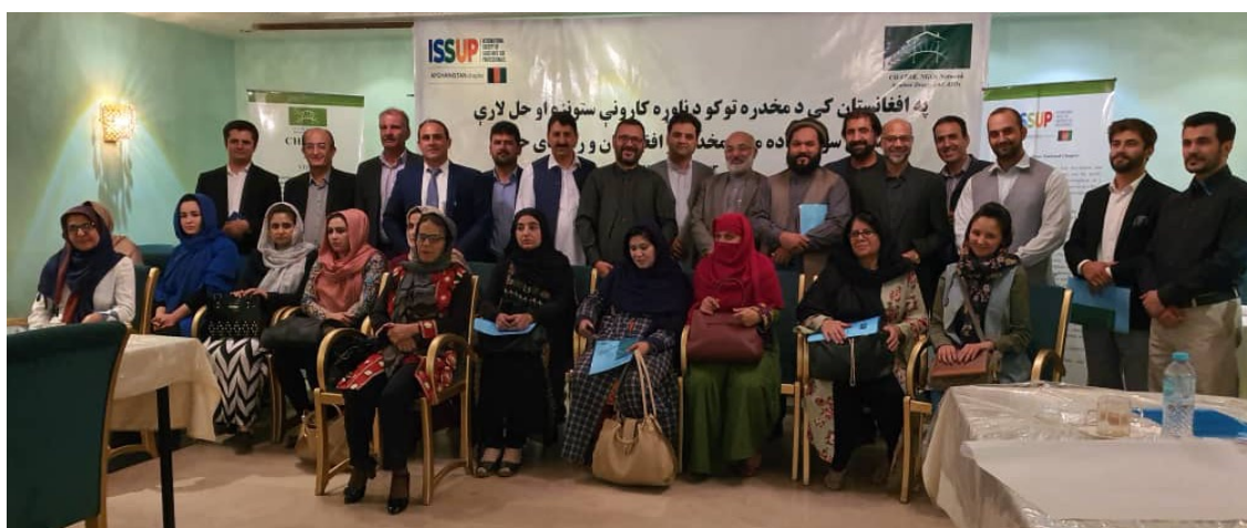
CHATAR and ISSUP Afghanistan Workshop