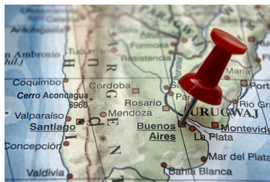
Alcohol Abuse in High School Students in Buenos Aires