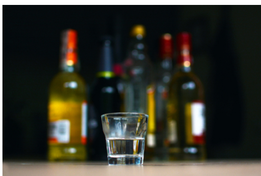
Alcohol Use Disorder Series from the Lancet Journals