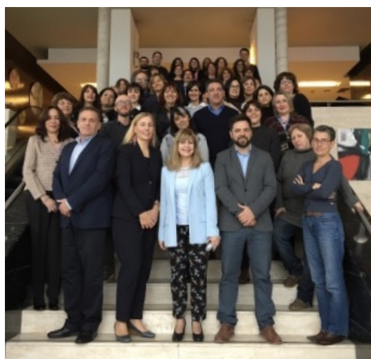
UNODC Training for Uruguayan Policymakers