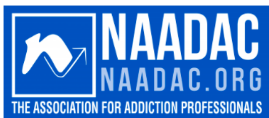
Free Webinar Series