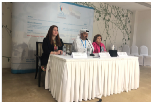
Next ISSUP Global Conference: Site Visit to Abu Dhabi