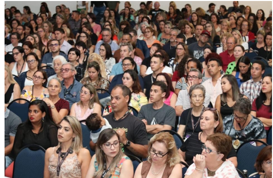
Above: Images from the Opening Ceremony