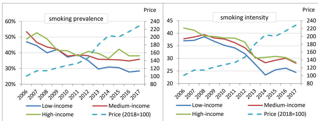
Figure 2. Smoking prevalence (left) and smoking intensity (right panel) trends by income group

Notes: Smoking prevalence is defined as the share of the households with positive tobacco consumption while smoking intensity represents the number of cigarette packs a household with positive expenditures on cigarettes smoked per month. Cigarette prices are defined as municipality/year average cigarette' unit values (ratio between total expenditure and quantity) and expressed in real terms (2018=100).