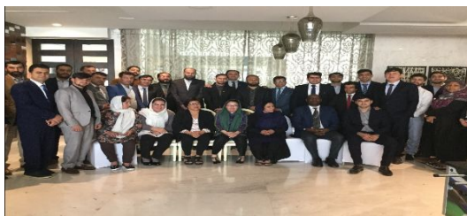
Training on the Universal Curriculum for Substance Use - Implementers Series (UPC1), Core Course for Afghanistan Cohort 2