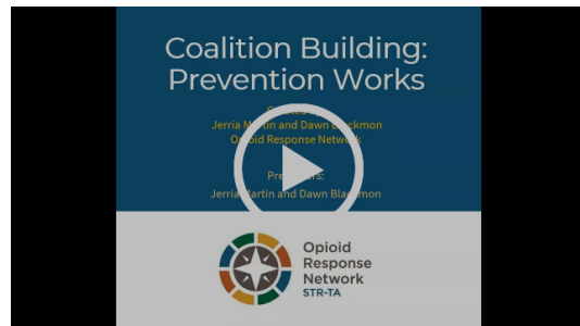
Prevention Webinar: Building Community Coalitions for Substance Use Prevention