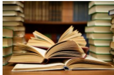
Addiction Journal Book Lists