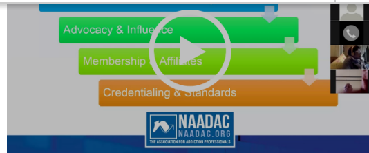
ICUDDR Webinar: National Addiction Studies Accreditation Commission