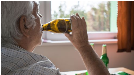
Alcohol Use in Times of the COVID-19 Virus