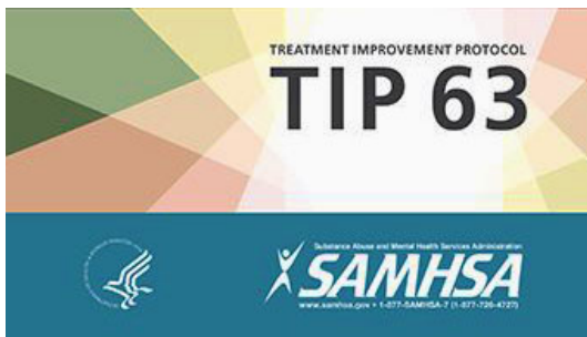
TIP 63: Medications for Opioid Use Disorder (SAMHSA)