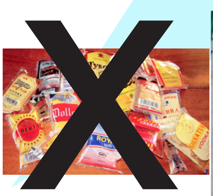
Civil society under their umbrella organization Uganda Alcohol Policy Alliance (UAPA) have commended government for enforcing the ban on Alcohol sachets in the market. This will reduce the rate at which children were accessing this product and reduce consumption by the youth.