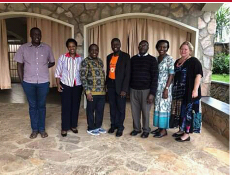
Task Team that fine-tuned the first draft of the National Alcohol Bill (July 2019).

UAPA has continued to initiate contacts with other influential ministries in matters of preventing alcohol harm such as Ministry of trade, industries and co-operatives regarding the ban on sachet Alcohol.