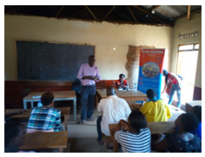
The Director KYDA, giving remarks about the role of the public on child protection and promotion of children's rights in relation to alcohol.

Our current Alcohol project works to Protect the rights of children from the illicit use of drugs. According to the UN convention, children should be protected from using drugs. Therefore KYDA works with children who are not in their families get protected especially children on the streets because they are in the open space.