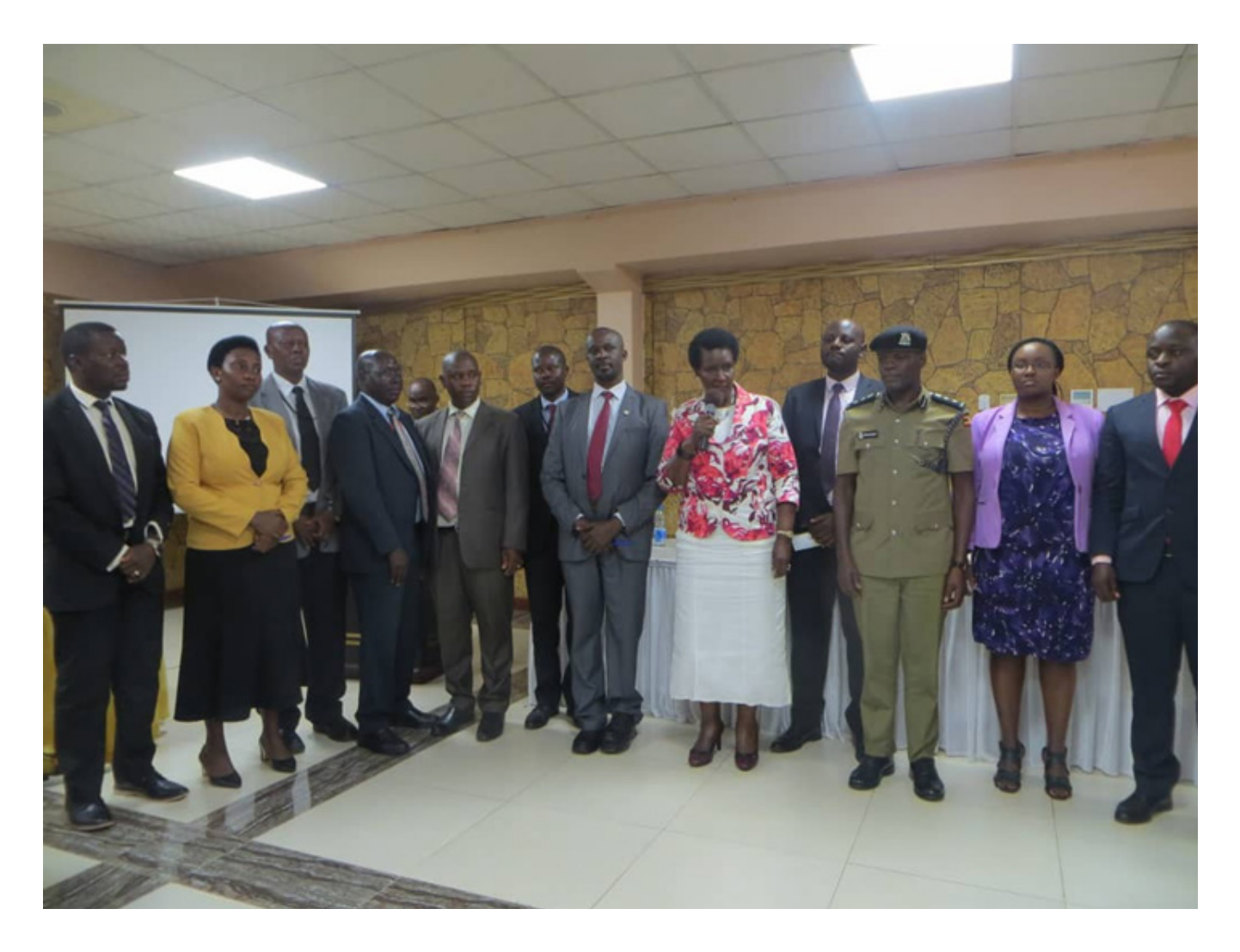
Minister of Trade, Industry, and Co-operatives, Hon. Ameria Kyambade launching a multi sectoral committee to implement the ban of Sachet Alcohol (September 2019).

UAPA delights in the government's decision to ban sachet alcohol which has been a longstanding major concern for UAPA and the country at large. To recognize efforts of civil society in this struggle, UAPA was elected to represent the civil society on the multi sectorial committee for monitoring the enforcement of the ban which was launched by Minister of trade Industry and Co-operatives on 10th September 2019. Some of the benefits of this ban was the sealing of all industrial production plants for sachet alcohol by Ministry of Trade Industries and cooperatives. There are