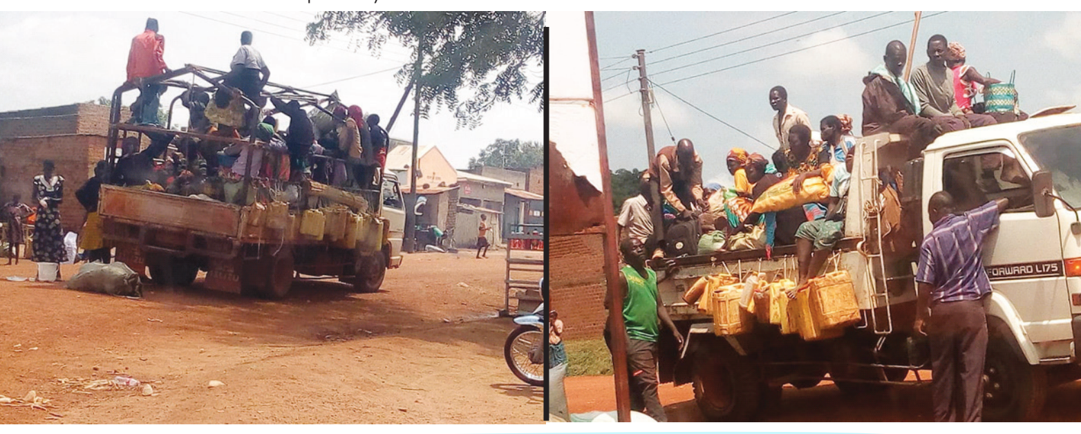
Alcohol production still a lucrative business in Northern Uganda, hence an urgent need for provision of alternative sources of income and advocacy for pro Alcohol control by-Laws in the region.

Leaders of Pader district launched a ban on alcohol made from molasses. This came after four people lost their lives after taking Alcohol the previous week. We really need to count the economic, social and physical loses due to Alcohol. In this we ought to do a lot more as a platform to address it. Much as there is unemployment, sober people can think more creatively to lessen the burden of poverty on families due to Alcohol.