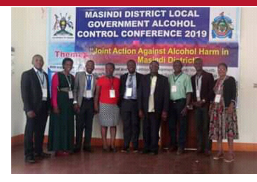
UAPA team in Masindi during Uganda National Association for community and occupational health (UNACOH) Alcohol conference (September 2019)