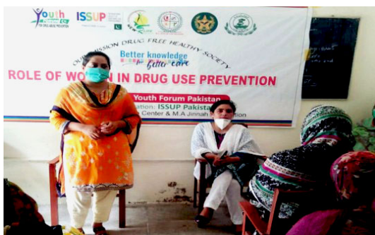
Pakistan: Seminar on the role of women in drug use prevention