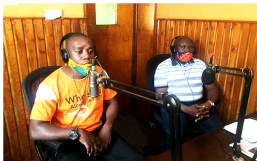
Uganda: Situation analysis of alcohol abuse among youth during lockdown