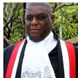
The Honorable Justice Mr. Malcolm Holdip High Court Judge Judiciary of Trinidad and Tobago