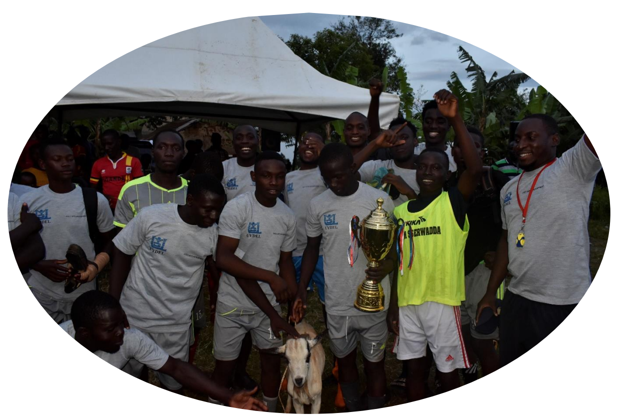
The victors from Sanga were crowned champions and awarded with a He Goat and a trophy Total number of participants