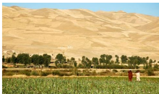
An Outcome Evaluation of Drug Treatment in Afghanistan