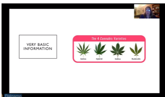
Cannabis, Policy & Your Community. What is Best Practice?

Here are some recent Knowledge Share contributions from ISSUP members