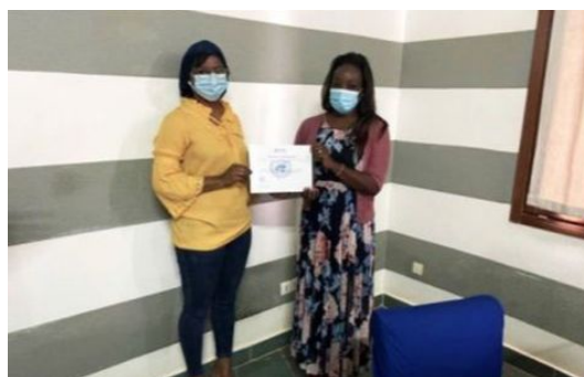
UNODC Civil Society Training in Senegal