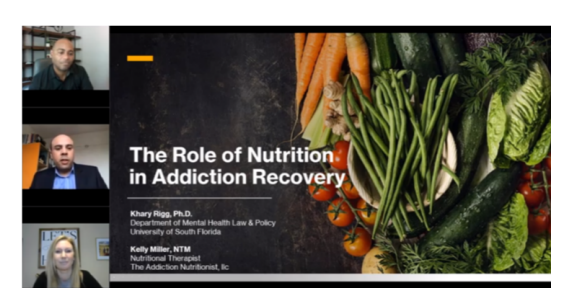
ISSUP Webinar: The Role of Nutrition in Addiction recovery