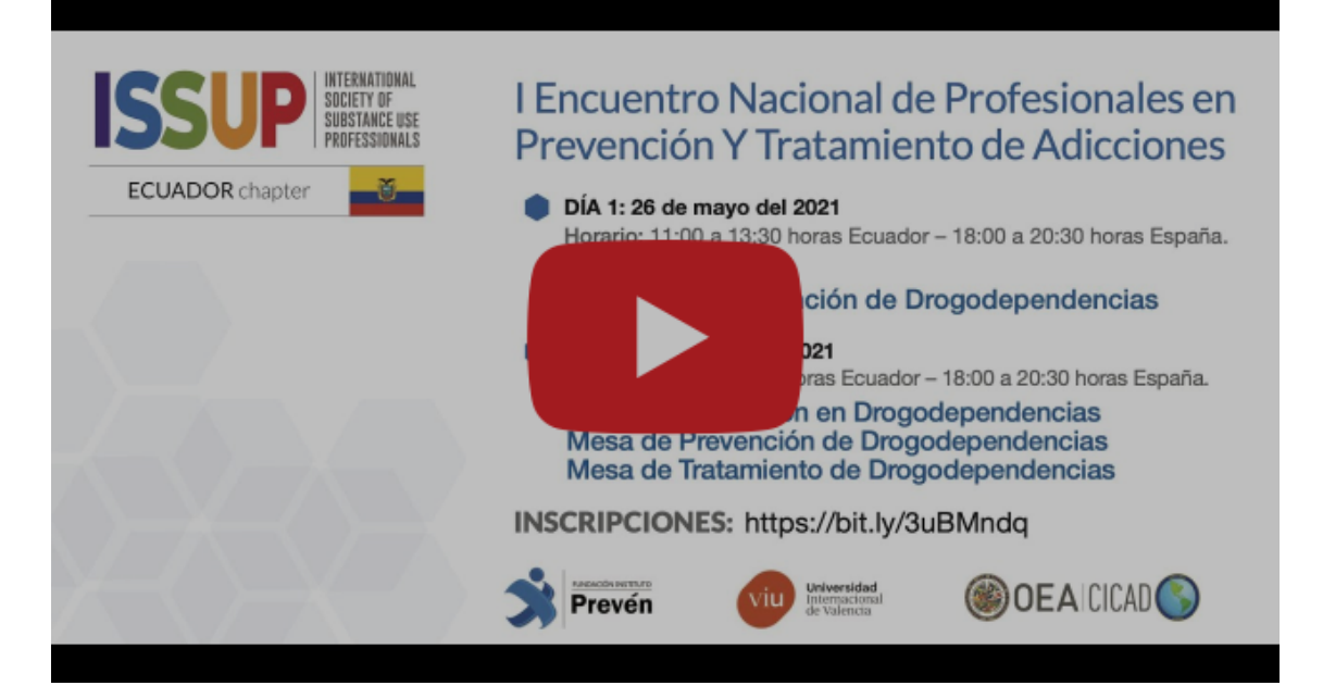
Mira el video de la invitación

El capítulo nacional de ISSUP en Ecuador te invita a participar en el Primer Encuentro Nacional de Profesionales en Prevención y Tratamiento de Adicciones. ¡No te pierdas esta oportunidad de conocer y conectarte con los profesionales en la reducción de la demanda de drogas! Inscríbete ahora en: <u>ISSUP</u>