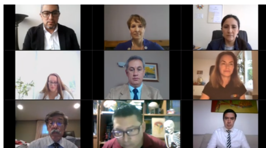
Encuentro nacional de profesionales en prevención y tratamiento