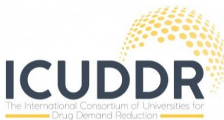
ICUDDR Survey on Credentialing Standards