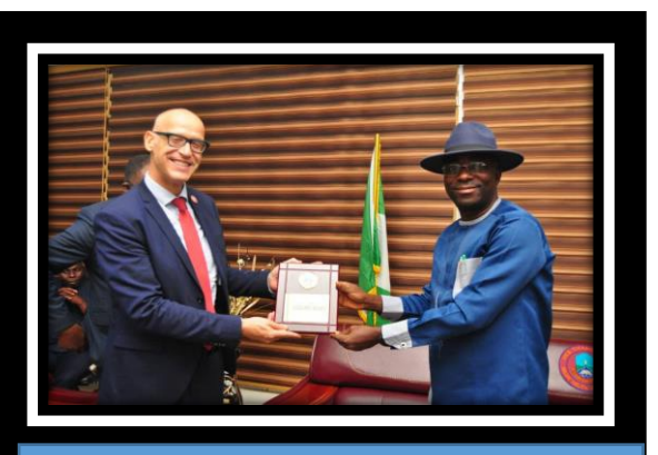
2. The VC presenting a plaque to the UNODC Country Representative