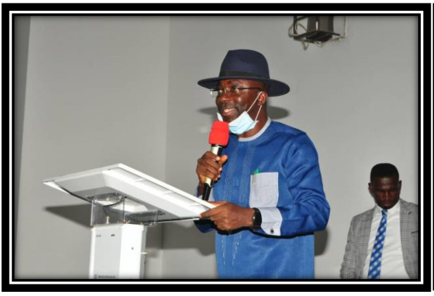
3. Opening speech by the Vice Chancellor