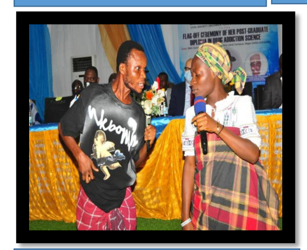
9. Theatre arts students presenting a play let on drug abuse.