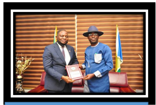
1. The VC presenting a plaque to the NDLEA Representative