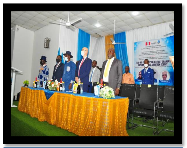
10. High table members singing National and the University anthem.