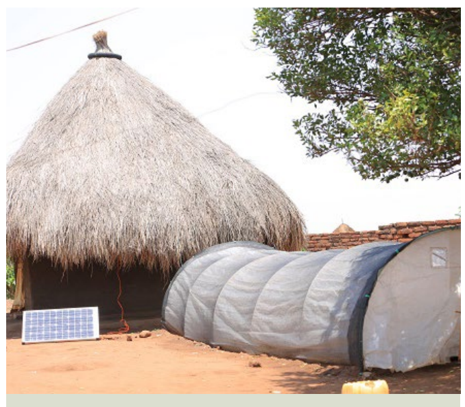
The solar powered irrigation system pump which has over 80 sprinkler points, distributing water at 360 degrees across the planted area @ FAO Uganda

By Agatha Ayebazibwe, Food and Agriculture Organization (FAO)