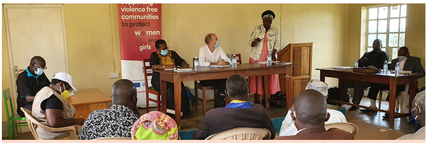
Caption:The Spotlight Inititive team interracting with District Local Government officials and Tooro cutlural leaders in Kyegegywa, with the EU Delegation Head of Programmes, Governance, sitting in the center.