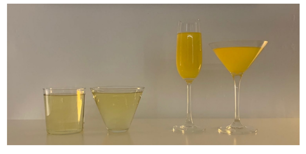
Figure 1. From left to right: glasses used in Study 1—straight-sided and outward-sloped tumblers containing 330 ml carbonated apple drink, and Studies 2 and 3—straight-sided wine flutes and outward-sloped martini coupes containing 165 ml non-carbonated passion fruit drink.

Several mechanisms might contribute to the effects of glassware design on consumption. One concerns biases in visual perception. Specifically, when estimating the volume remaining in a drink, people may use height as a cue to volume<sup>19</sup>. For example, the true midpoint of drinks presented in outward-sloped glasses is underestimated, as compared to straight-sided ones<sup>16,17,20</sup>. This midpoint bias reflects an inability to make accurate visual judgments about the volume remaining in the glass, which might in turn influence drinking speed and amount consumed.