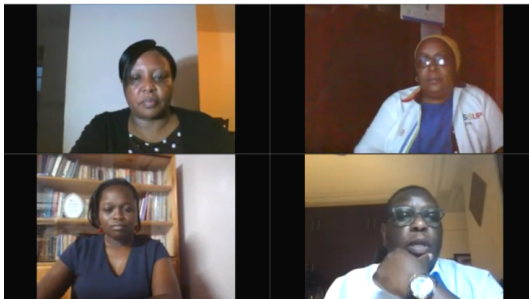
The impact of SUD in Educational Institutions in Kenya

The ISSUP Knowledge Share holds a wealth of information submitted by our members and partners. Read our sharing guide and make your first post today.