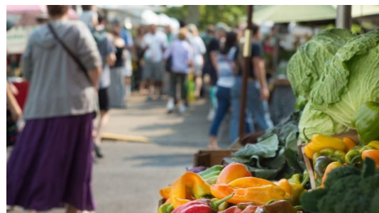
Nutrition: Factsheet on alcohol related thiamine deficiency