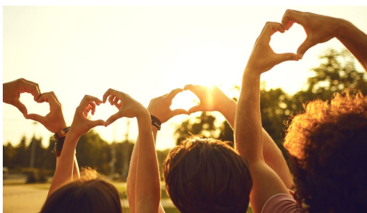
Strategy for Preventing Opioid Use Disorder in Communities