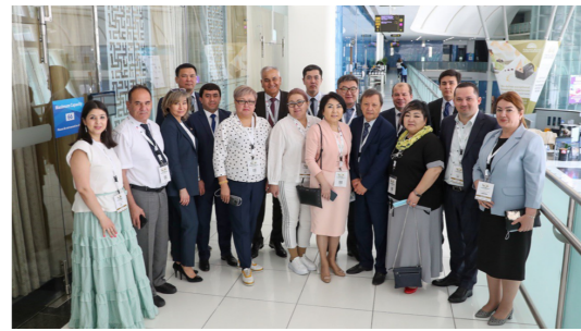
UNODC Central Asia dialogue at the Abu Dhabi 2022 Conference