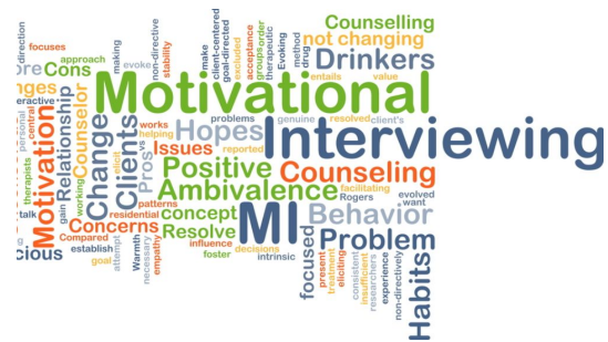
MINT Motivational Interviewing Videos