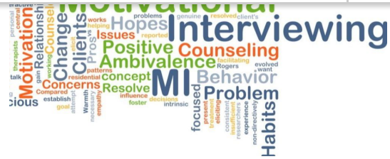
Motivational Interviewing Reading List