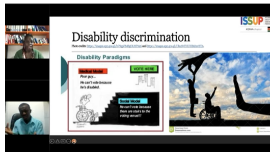
ISSUP Kenya webinar on disability mainstreaming and inclusion