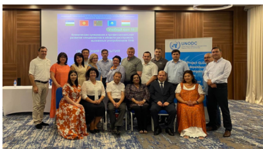
UNODC supports Advanced Level UTC in Central Asia

The ISSUP Knowledge Share holds a wealth of information submitted by our members and partners. Read our sharing guide and make your first post today.