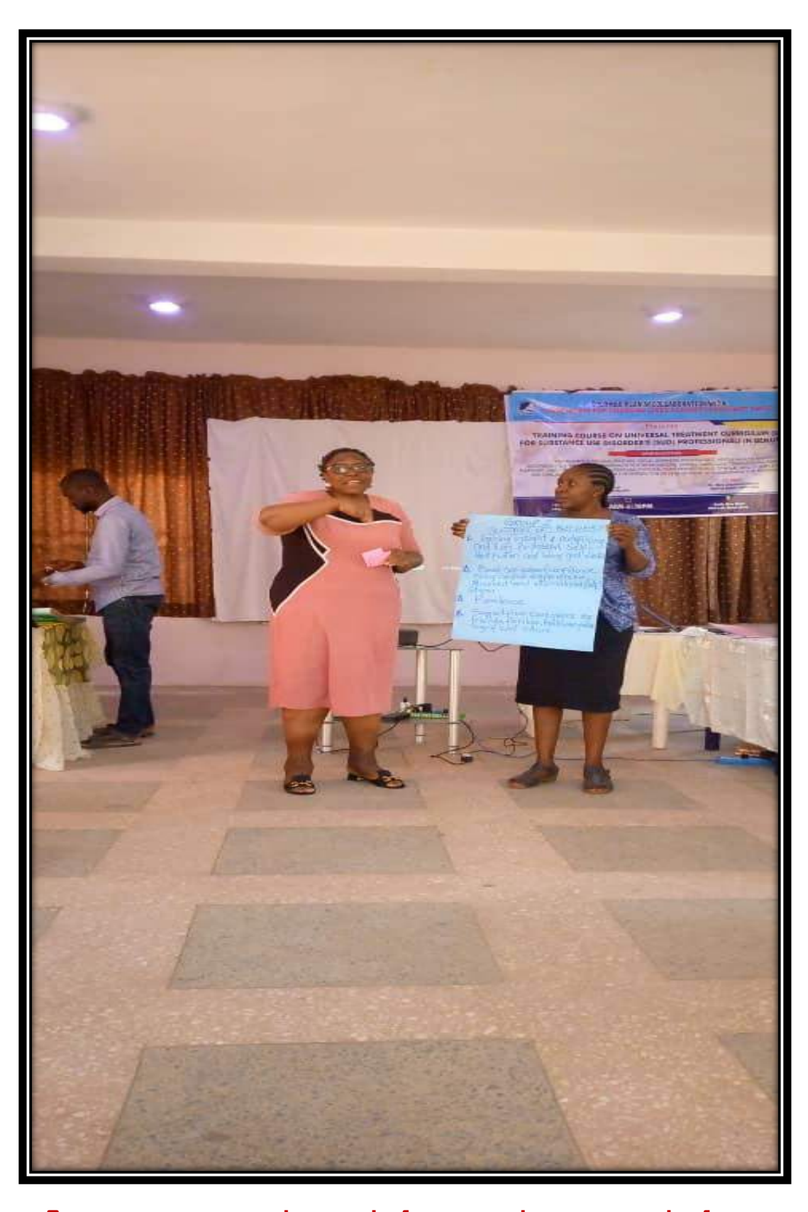
Group two presenting their work after group discussion on day five