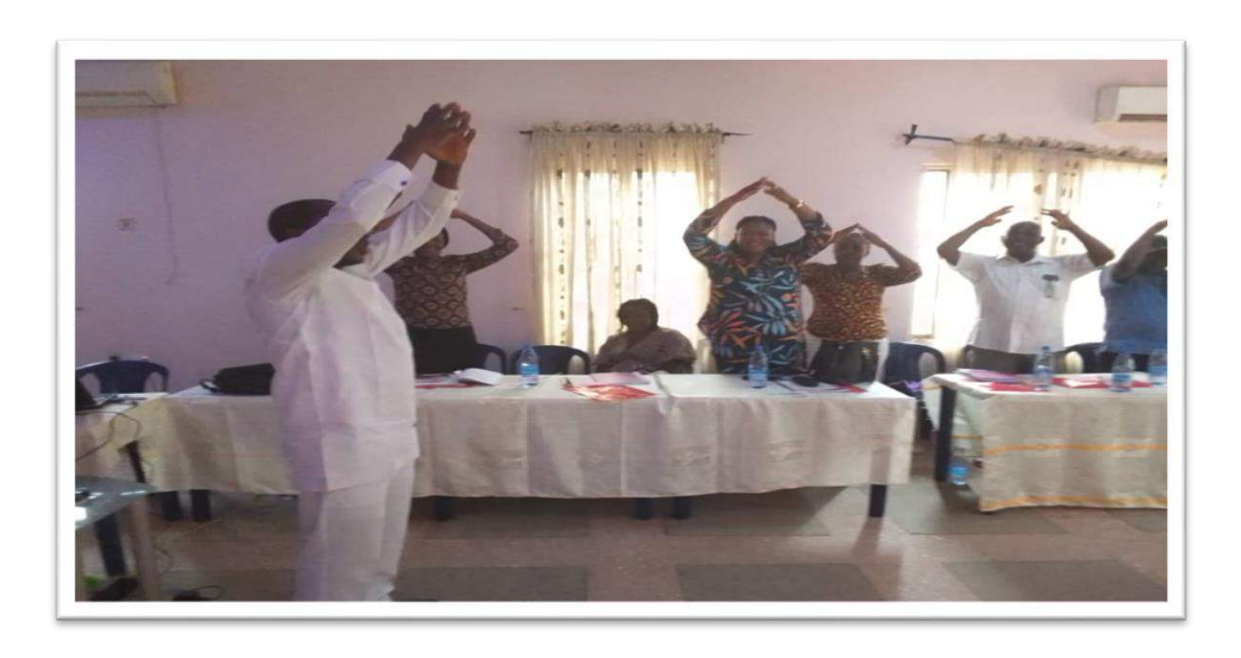
Above is participants performing an energizer after lunch-break