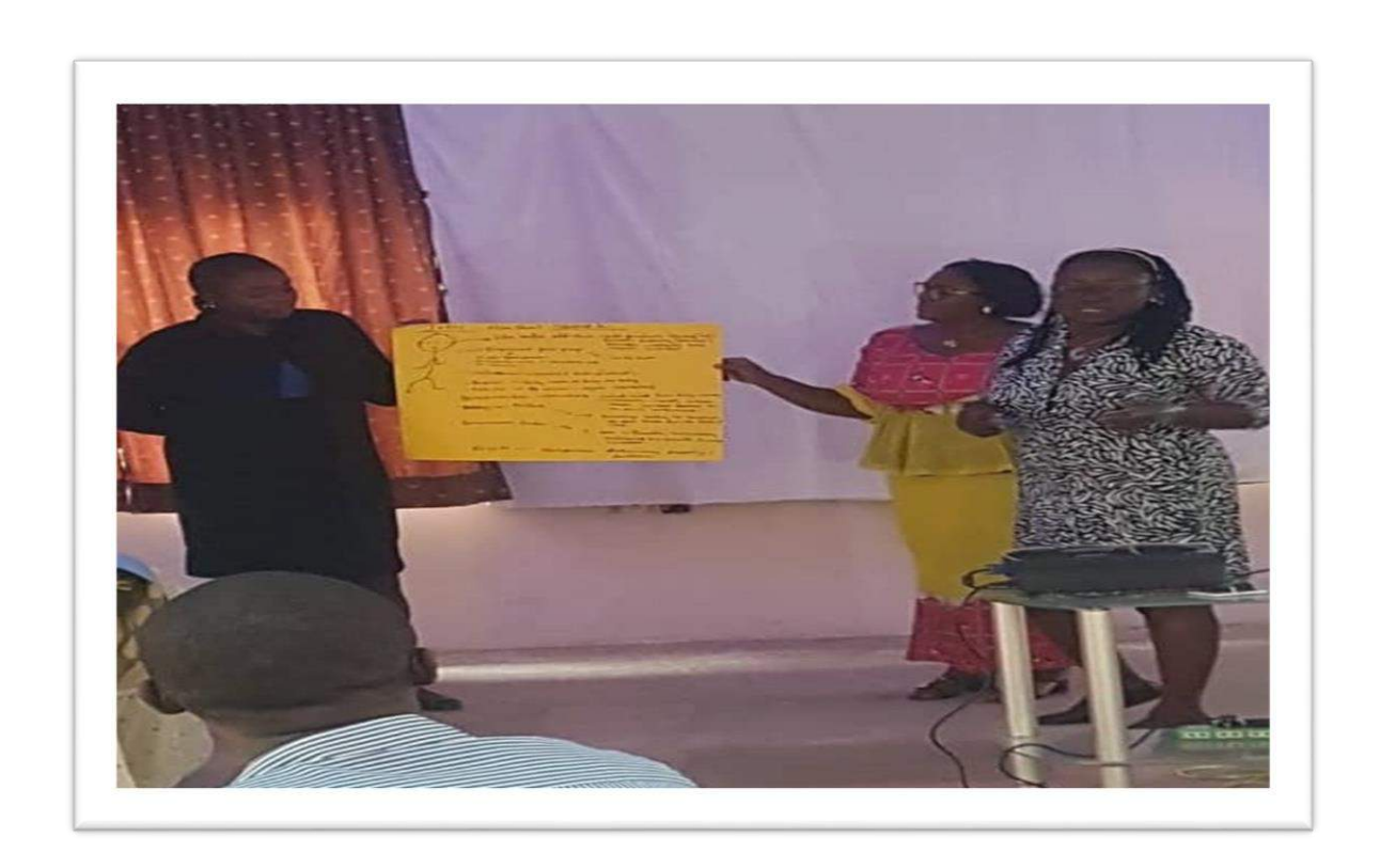
Group two above presenting their work after group discussion