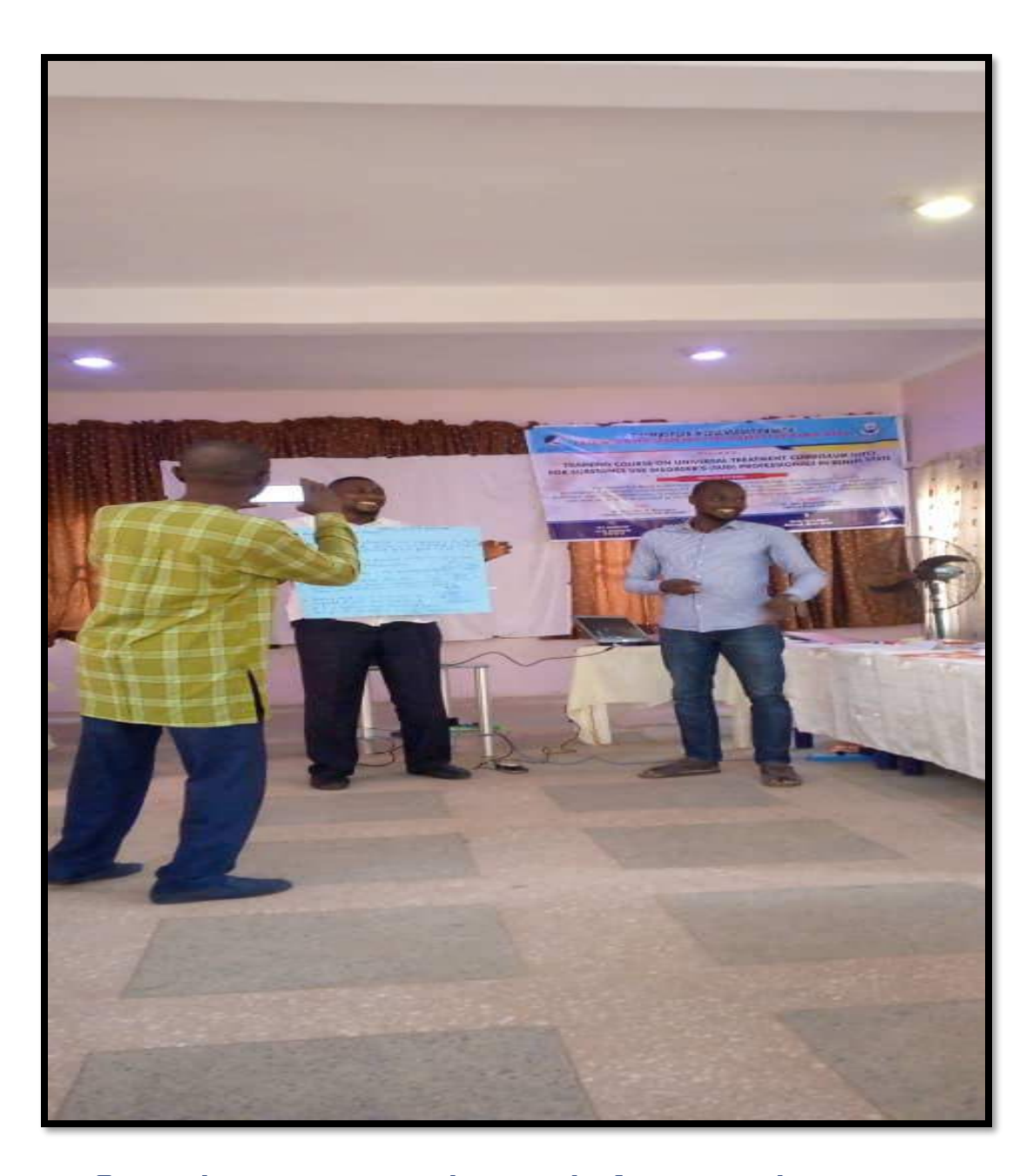
Group three presenting their work after group discussion