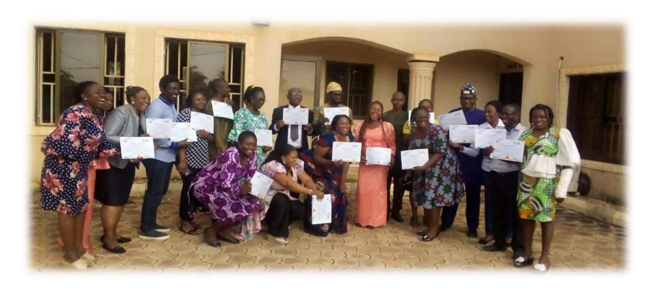
Participants above & below celebrating the receipt of their beautiful certificates