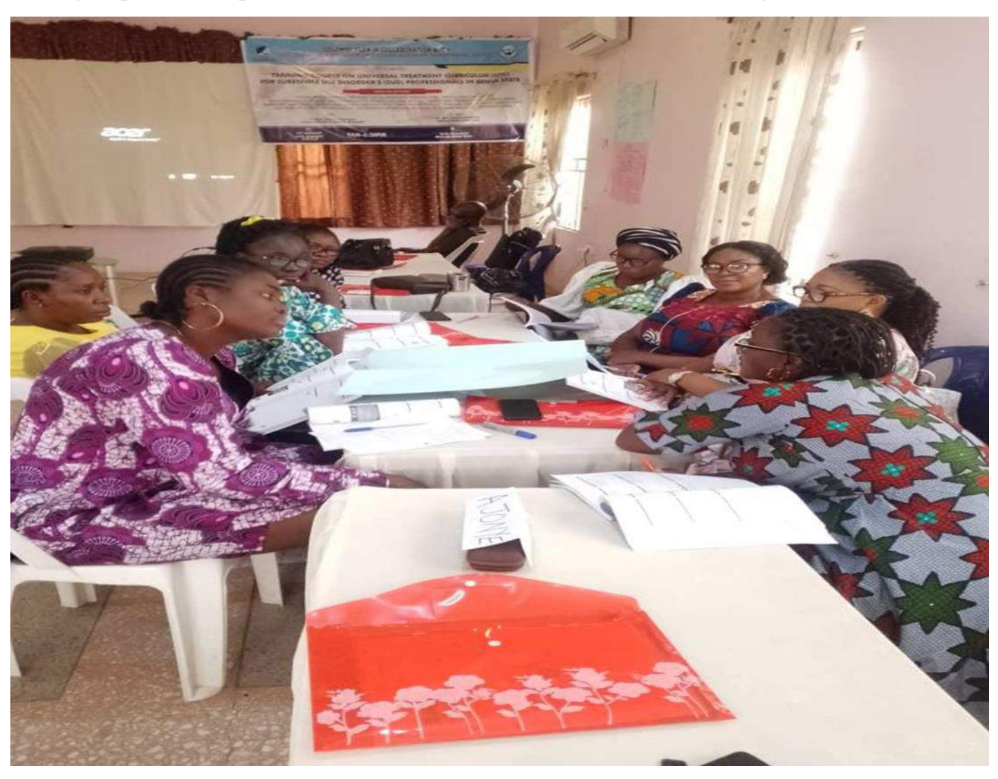
Group one above during group work brain-storming session on day 1

In addition to lecturing method, other methods were used in conducting the training as seen in the pictures below, e.g Group work, group presentations, participant sharing of personal experience, whole class collaborative exercises, energizers etc.