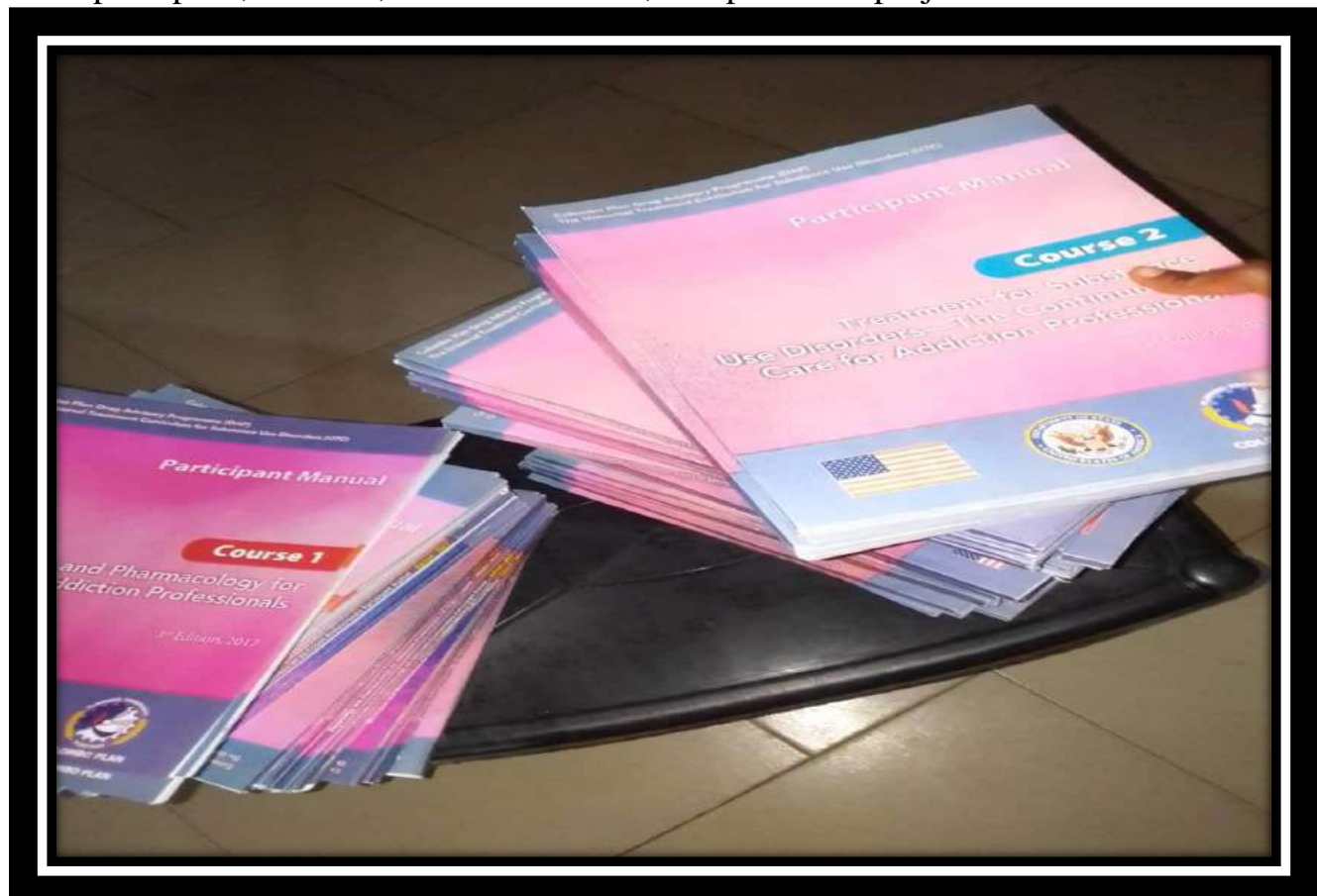
Some training materials used for the training e.g (UTC 1 & 2 booklets)

Materials used during the program as displayed on the table below were reproduced copies of complete participant' manual on Curriculum 1 & 2 originally developed by the Colombo-Plan. Other materials and equipment's used include: Newsprint pads, markers, cardboard sheets, computer and projector.