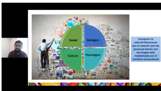
Seminario web: Prevención del Consumo de Alcohol y Otras Drogas