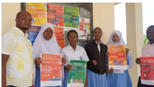
Tanga and Muheza 'Listen First' Activity Report

The ISSUP Knowledge Share holds a wealth of information submitted by our members and partners. Read our sharing guide and make your first post today.