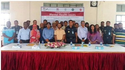
Training of trainers (ToT) on mental health for prison staffs

The ISSUP Knowledge Share holds a wealth of information submitted by our members and partners. Read the sharing guide and make your first post today.