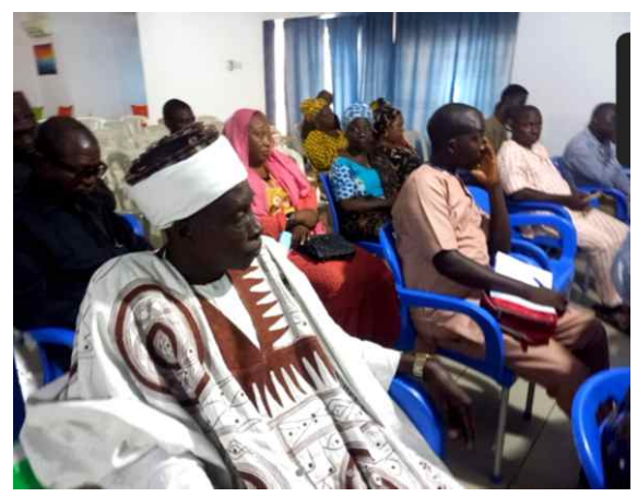
Participants at the seminar