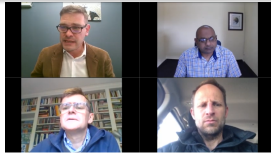
ISSUP South Africa Webinar: Defining Recovery