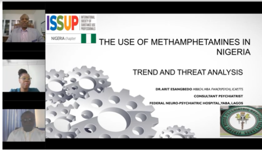
Webinar: The use of methamphetamines in Nigeria