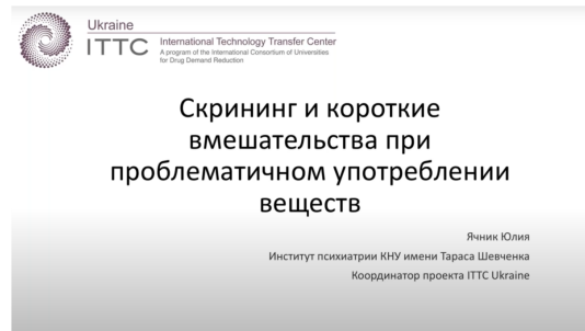
Лекция 2: Серия публичных лекций по Центральной Азии