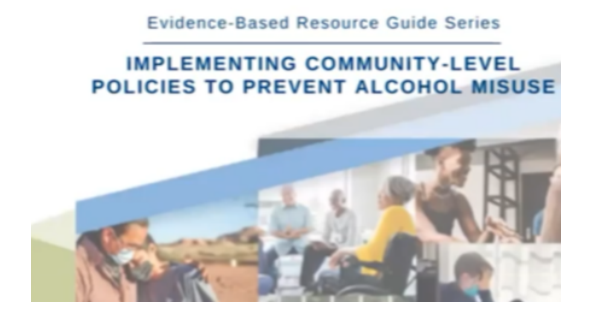
Implementing Community-Level Policies to Prevent Alcohol Misuse