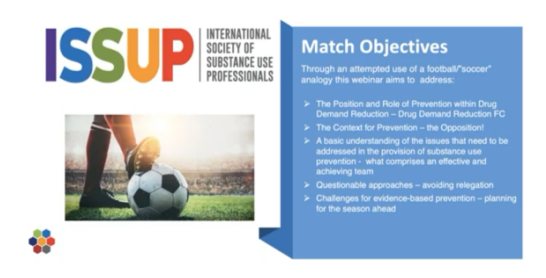
Substance use prevention: A review through the language of football

The ISSUP <u>Knowledge Share</u> holds a wealth of information submitted by our members and partners. Read the <u>sharing guide</u> and make your first post today.