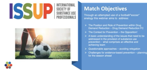
Substance use prevention: A review through the language of football