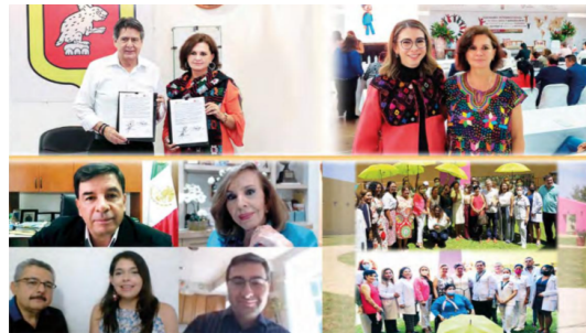
ISSUP Mexico / CIJ Informa 98