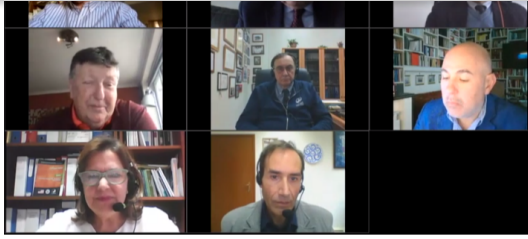
World AIDS Day Webinar hosted by ISSUP Italy