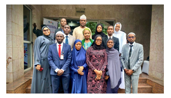
ISSUP Nigeria Chapter Newsletter – <u>10th Edition</u>