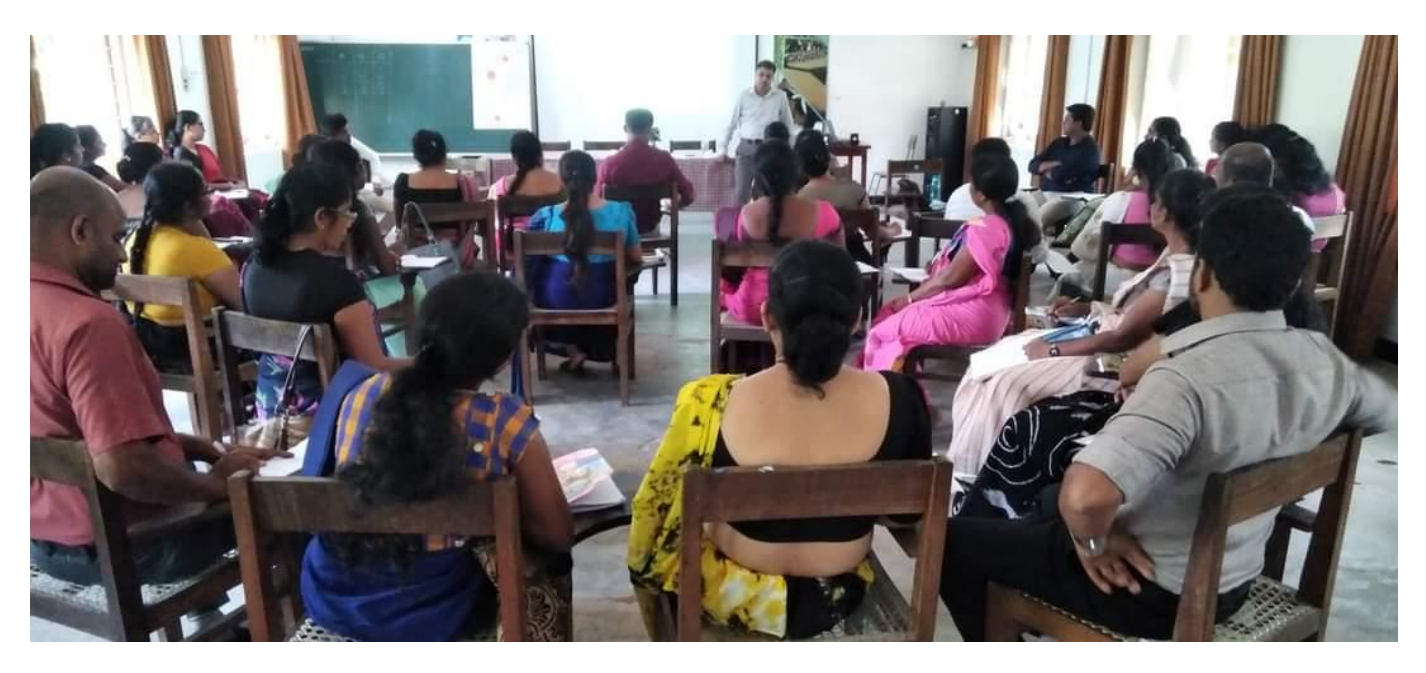
With Presentations and Roll Plays