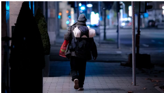
New Psychoactive Substances in the Homeless Population