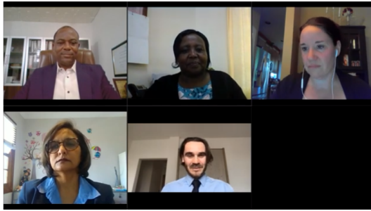
Developing the Addiction Workforce in Africa: Progress and Issues