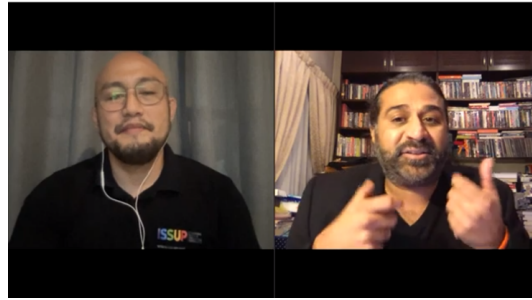
Building Resilience and Bouncing Back from setback in Recovery