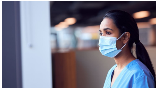
Trauma and Substance Use Among Healthcare Workers